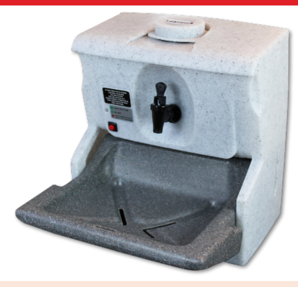
The Handeman 12/24V 12V/220W (red label), 24V/250W (blue label) and 12V/90W (purple label)