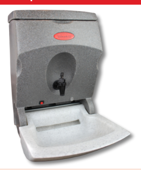
The TealWash 12/24V 12V/180W (red label) and 24V/250W (blue label)