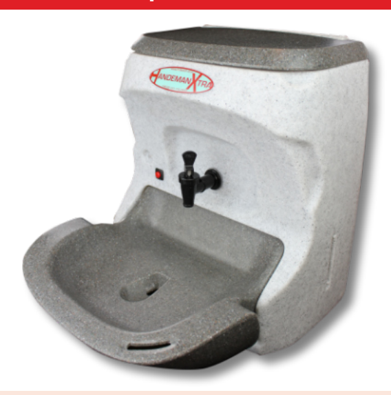
The Handeman Xtra 12/24V

12V/220W (red label), 24V/250W (blue label) and 12V/90W (purple label)