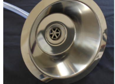
The automatic sensor