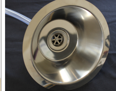
The automatic sensor