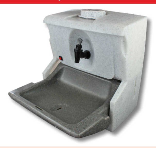
The Handeman 12/24V

12V/220W (red label), 24V/250W (blue label) and 12V/90W (purple label)