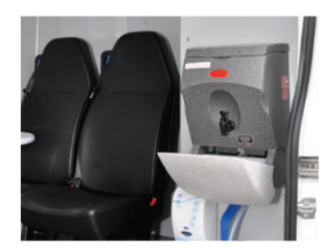
Motor vehicles »